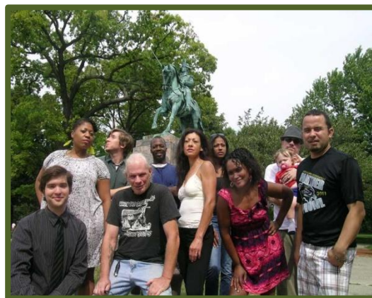
Cast of The March to Kosciuszko

This is the second play I've seen produced by you. Both times I learned stuff I never knew before. And both times I had to go to the Internet when I got home to try and learn more. Please do this again.